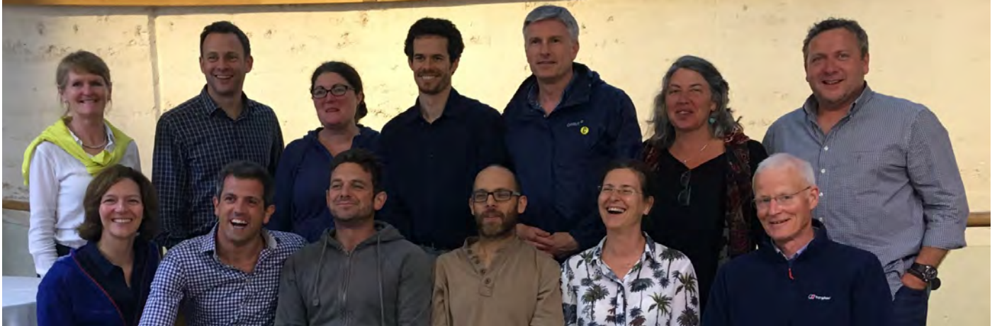
CEO participants and faculty 2017