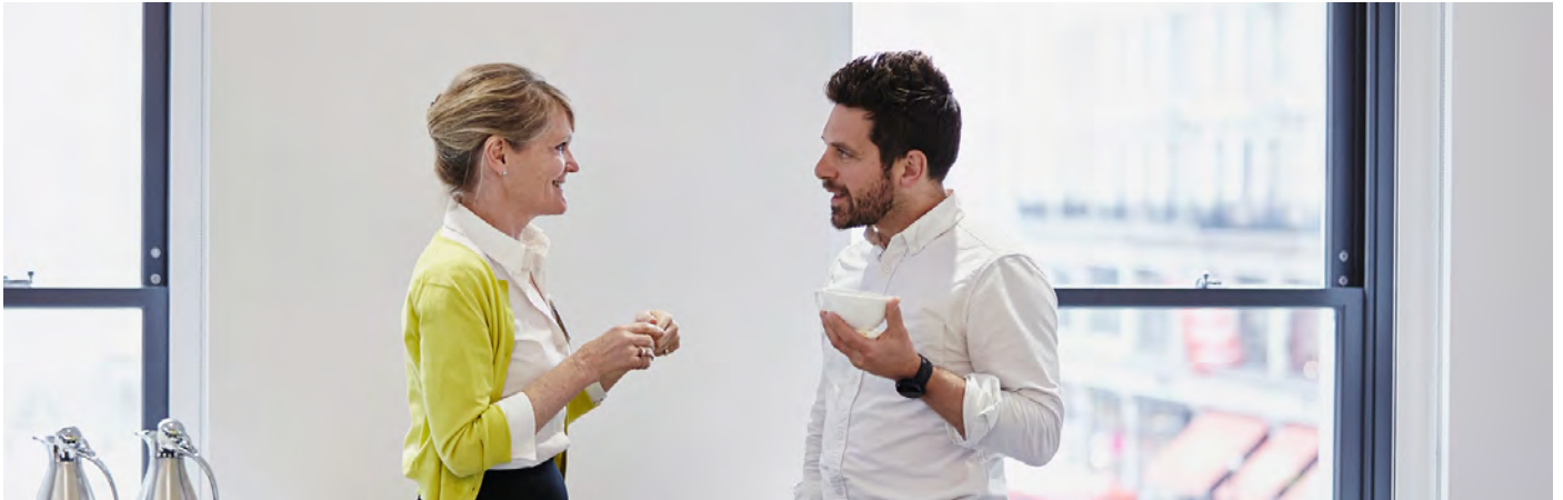
CEO participant and faculty 2017