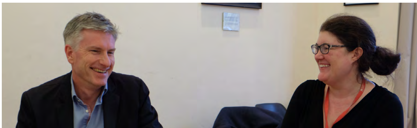
Strategic finance jargon busting 2017

04 Governance working day with your Board Chair.